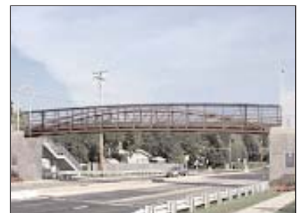
The Dundee Road Pedestrian Overpass will be completely rebuilt by the end of the summer.