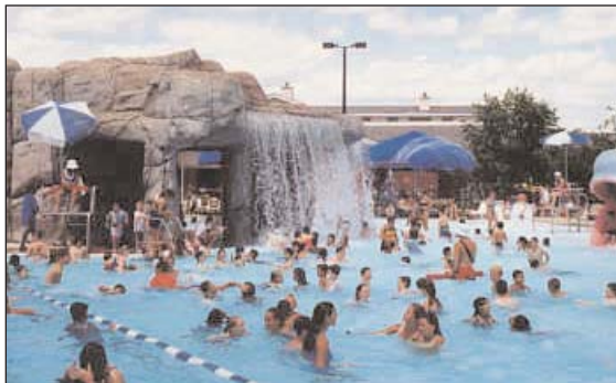
The Aquatic Center is a great place to keep cool as the summer heats up. For information about any Park District program, call 847-465-3333.

Summer sun translates into summer fun and nobody does fun like the Wheeling Park District. Here are a few events for you and your family to check out: