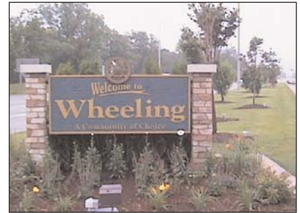
New signs and landscaping welcome visitors traveling South on Milwaukee Ave. New signage and beautification projects are some of the improvements going on throughout Wheeling.

The rehabilitation of the Dundee Road Pedestrian Overpass is scheduled for this summer. Effective June 7, sidewalks will be closed on the north side of Dundee Road at St. Armand (eastbound pedestrian traffic), Cedar Drive (westbound pedestrian traffic), RTE 83 (westbound pedestrian traffic) and on the south side of Dundee Road at each of the driveways accessing London School. The overpass superstructure over the roadway is tentatively scheduled for demolition on /Saturday and Sunday June 12/13 with replacement scheduled for the weekend of July 25/26 and with completion on or prior to August 20. During the scheduled times of demolition and replacement Dundee Road will be closed to all traffic from Schoenbeck Road to Route 83.