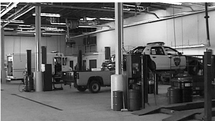
Part of the renovation of the new Public Works facility included the construction of a state-of-the-art mechanic's bay.