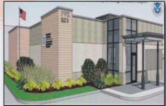
Rendering of the U.S. Customs and Border Patrol facility at Chicago Executive Airport

Although last year's extraordinary challenges are still very much with us, there are many reasons to be optimistic. The qualities that make Wheeling a great place to live and a great location for business and development remain unchanged, with current projects moving forward and new inquiries arriving regularly. Almost all of the townhome units at the Wolf Crossing development on North Wolf Road have now been completed, as have the residential units at the Uptown 500 mixed-use development on Dundee Road. The redevelopment of the gas station at Dundee and Elmhurst as a 7-Eleven was recently finished, and a new gas station / restaurant project is under construction on South Milwaukee near Chicago Executive Airport. Speaking of the airport, it recently broke ground on a new U.S. Customs and Border Patrol facility that will help process international arrivals more efficiently; the Village was able to assist this project by using our home-rule authority to issue airport revenue bonds at no risk to Wheeling taxpayers.