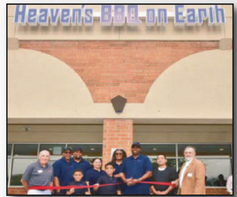
A ribbon cutting ceremony was held for Heaven's BBQ on Earth on June 27.