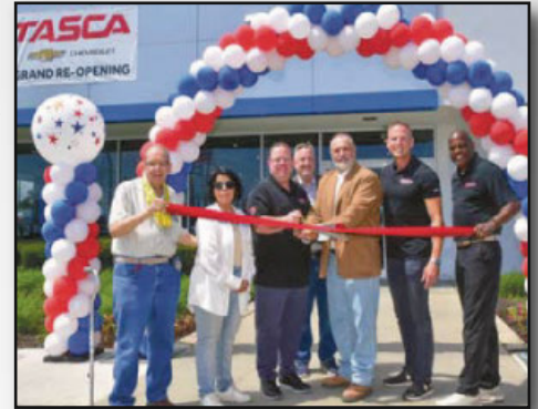
A ribbon cutting ceremony was held for Tasca Chevrolet, formerly Bill Stasek, on July 29.

2 We'll be back in touch soon with more updates. Until then, on behalf of the Village Board and the Village staff, have a happy autumn!