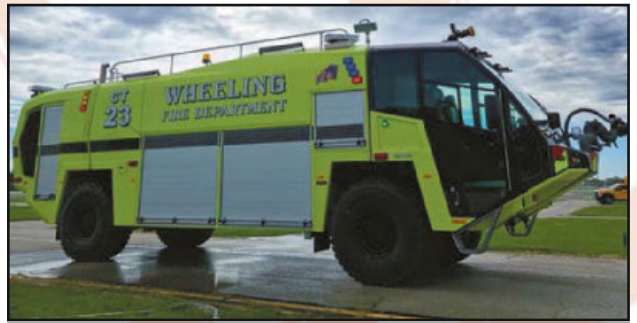
The Village took delivery of a new Aircraft Rescue and Firefighting truck earlier this year.

The Village has had a successful year with respect to its own projects, too. Our contractor recently completed the annual sidewalk program, replacing sidewalk squares along 15 streets in northeast Wheeling to help ensure safe pedestrian travel. The improvements to Northgate that I mentioned in the previous newsletter are all but done, and the resurfacing of the small portion of Wolf Road that wasn't included in the recent complete reconstruction of the roadway will be finished soon. Progress continues on the replacement of water infrastructure throughout Lakeside Villas—a complex project that has required coordination between the Village, our contractor, and the neighborhood's residents—as well as the construction of our new freestanding Fire Station 42 on McHenry Road. Another major recent investment recently came into service: the Fire Department's new Aircraft Rescue and Firefighting (ARFF) apparatus—colloquially known as a “crash truck”—which replaces the nearly 40-year-old apparatus that the Department had been using.