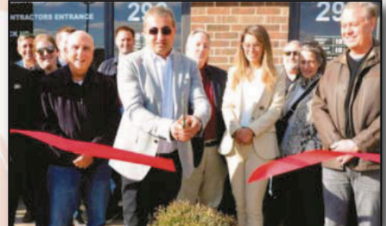
Members of the Wheeling Village Board and Planning Commission celebrated at a ribbon-cutting for a new showroom at Wheeling business DTK Stoneworks on March 18.

When it's appropriate and in our residents' best interests, the Village also finds ways to promote private business activity. We recently updated and expanded the program now called the Wheeling Restaurant, Entertainment, and Retail Build-Out Grant, which reimburses a portion of certain types of improvements to commercial properties in the Village's tax increment financing districts; anchor restaurants, anchor retailers, and entertainment venues will now be incorporated in the program. Wheeling's economy remains robust, with sales tax revenues higher than expected, several new and existing businesses opening and expanding, and mixed-use developments showing notable progress. Most recently, the Village Board granted preliminary approvals to Forest View LLC, which seeks to redevelop the former Solex office building at Dundee and Milwaukee as a mixed-use project, with commercial space on the ground floor and 55 residential rental units above. We'll provide updates on this and other projects as appropriate.