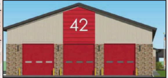
Fire Station 42 at 175 McHenry Road officially opens on May 10.

Spring has returned to Wheeling, and I'm happy to report that the Village is already making good use of the year. Most notably, we'll soon be celebrating the grand opening of the new Fire Station 42 on McHenry Road, achieving a longtime goal of establishing a freestanding fire station west of the railroad tracks. Our contractors have begun work on this year's Street Improvement Program—which will resurface approximately 16,000 linear feet of roadway at various locations throughout