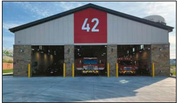
New Fire Station 42, 175 McHenry Road

In addition to our ordinary annual capital projects—street, streetlight, sewer, sidewalk, and watermain improvements in several areas—we completed the first half of a major stormwater management project that will bring relief to flood-prone properties in South Dunhurst. Phase One involved the construction of a detention basin north of Mark Twain Elementary School; this year, Phase Two will add storm sewer pipes to move runoff to the new basin. Other noteworthy projects scheduled for 2025 include the $2.73 million Buffalo Creek Streambank Stabilization Project—which will be mostly funded through a grant from the Illinois Environmental Protection Agency—and the construction of a watermain loop that connects the Village's water system between North and South Milwaukee Avenue; in addition to establishing more consistent water flow and pressure, the project will add properties to the system that aren't currently served by it and will extend the sidewalk on Milwaukee south to Sumac Road.