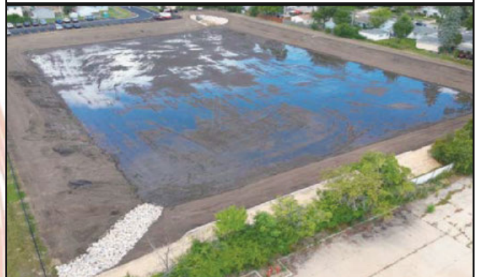
South Dunhurst detention basin