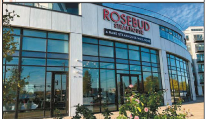
Rosebud Steakhouse, 502 W. Dundee Rd.