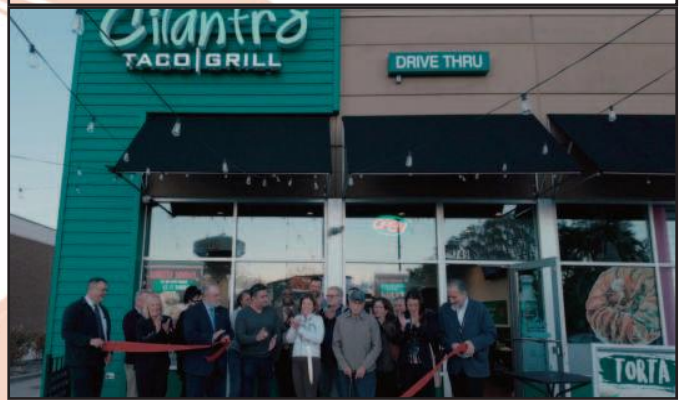
Cilantro Taco Grill, 749 N. Milwaukee Ave.

Members of the Village Board, Plan Commission, and staff attended ribbon-cuttings for Gas N Wash and Cilantro Taco Grill (under new ownership).