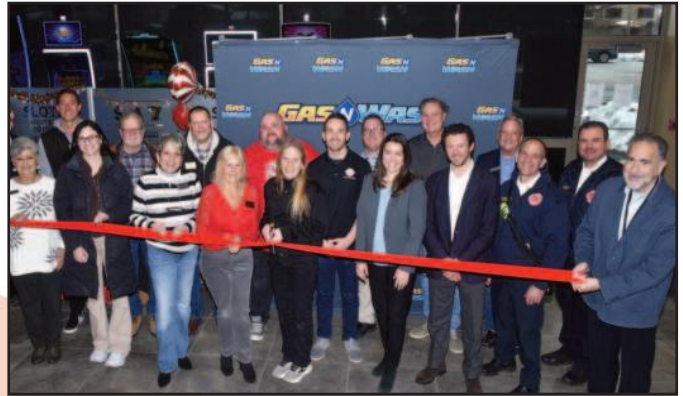
Gas N Wash, 1900 E. Hintz Road

We'll have more to share in the year ahead. Until then, we wish you all the best in 2026!